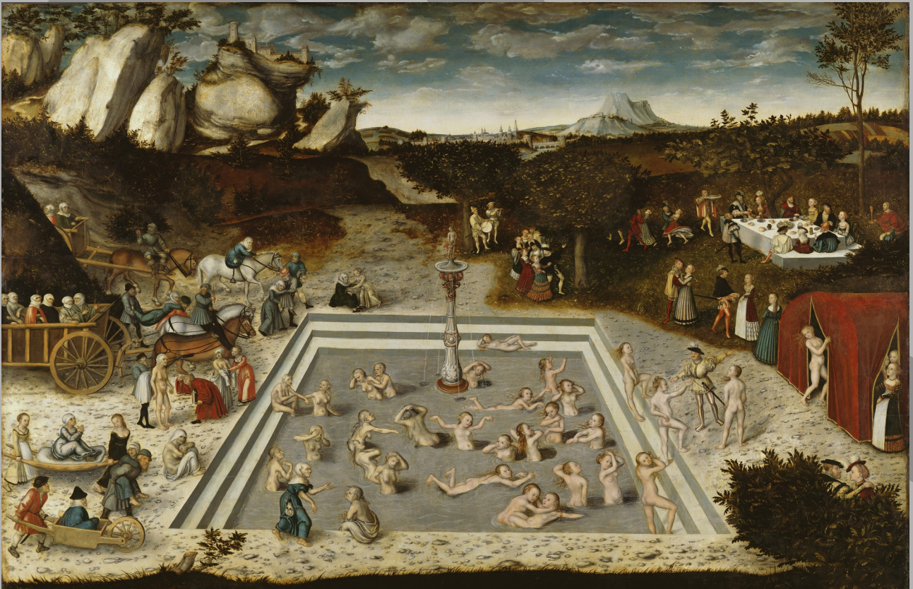
The Fountain of Youth, 1546 painting by Lucas Cranach the Elder